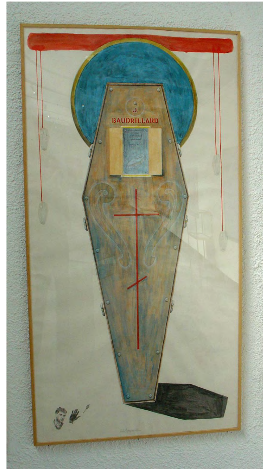
"Philosophical Cemetery. Coffin for Baudrillard – Selected Writings", 1992