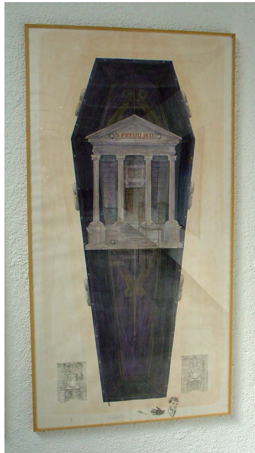
“Philosophical Cemetery. Coffin for Freud – General Introduction into Psychoanalysis”, 1992