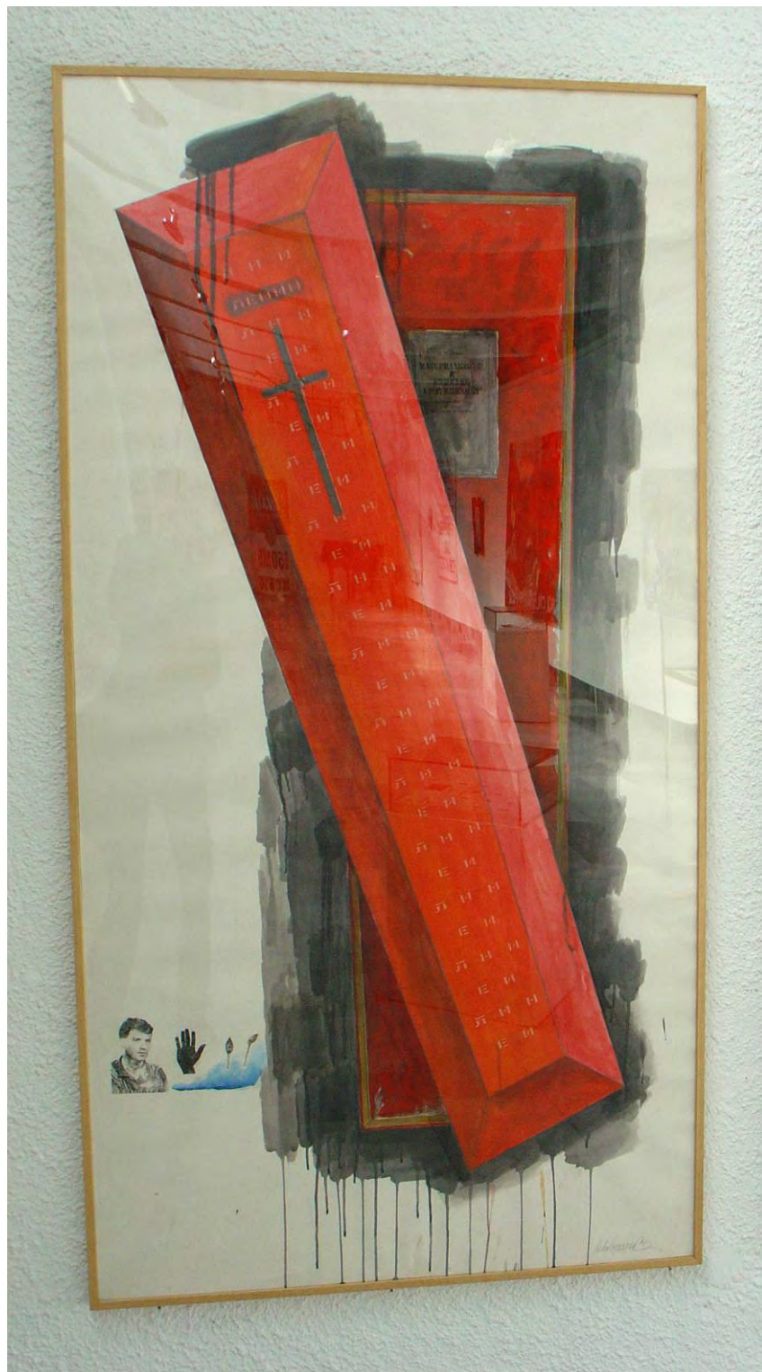
“Philosophical Cemetery. Coffin for Lenin – Materialism vs. Empiriocriticism”, 1992