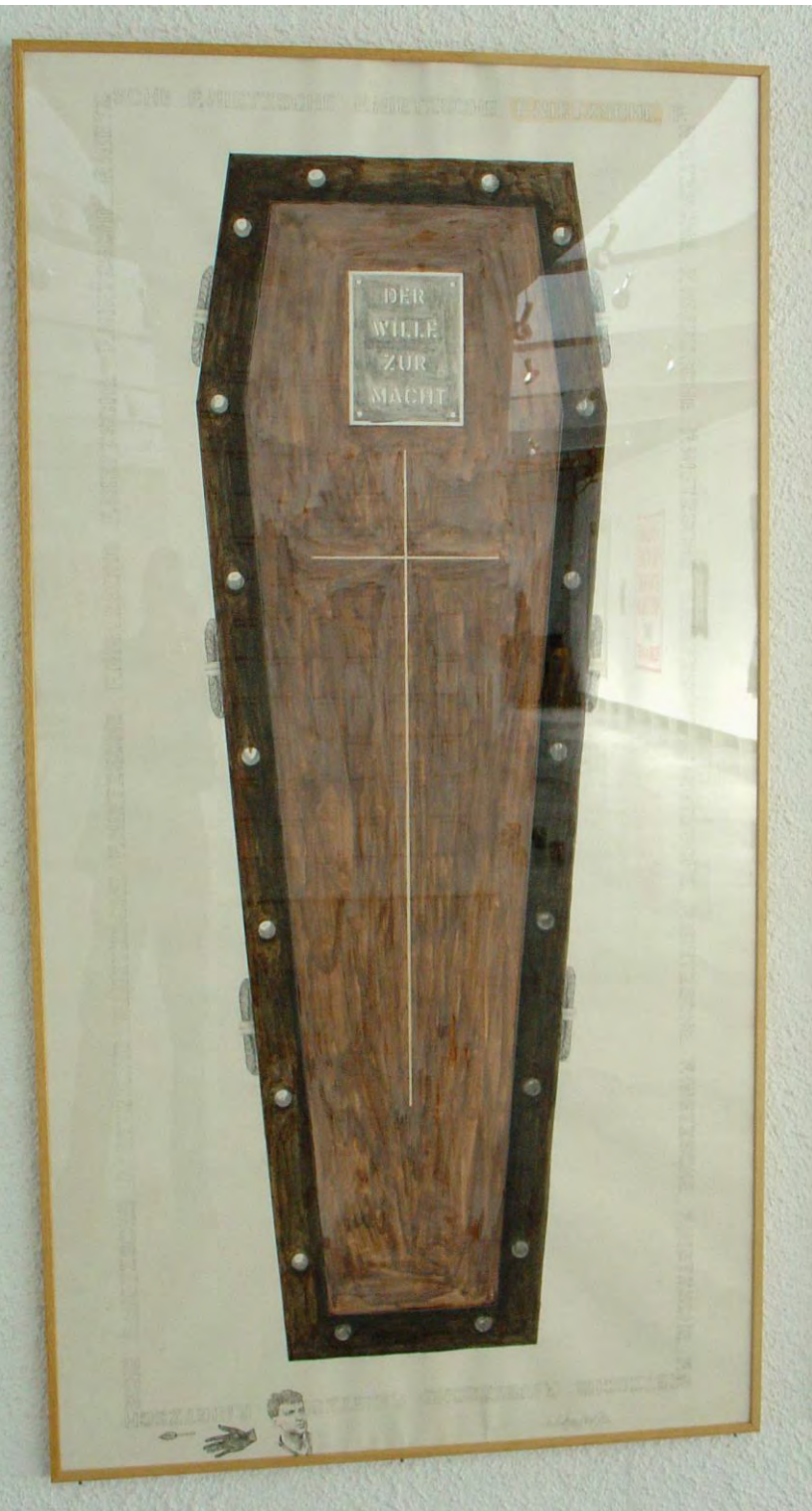
"Philosophical Cemetery. Coffin for Nietzsche – The Will to Power", 1992