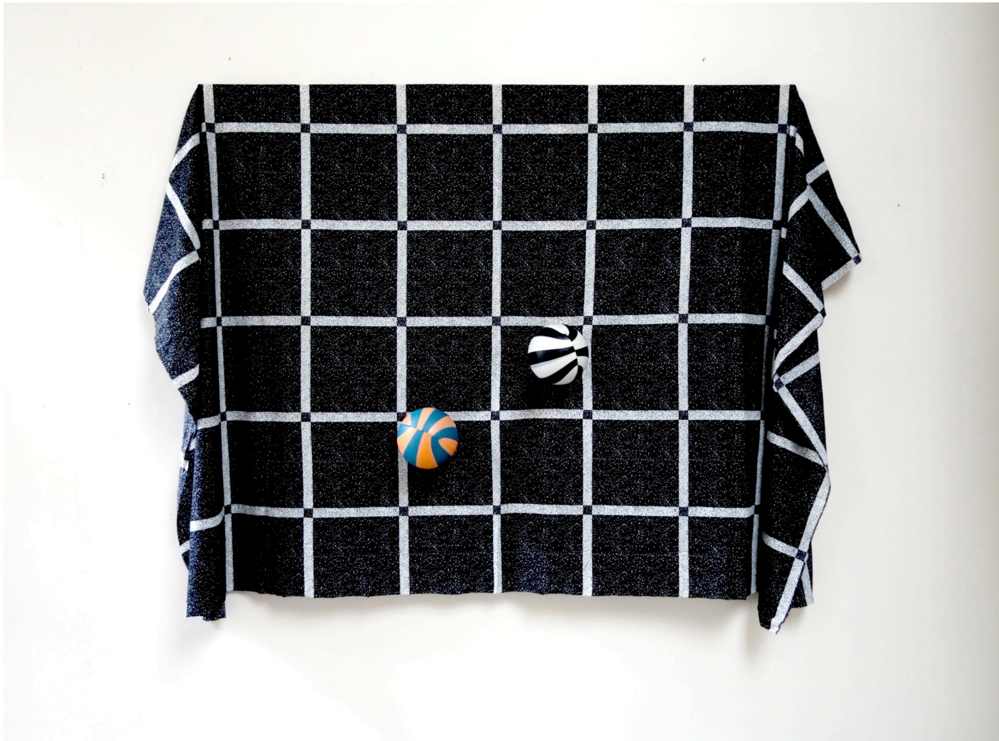
Rada Boukova Plateau , 2017 print fabric, plastic balls, wood 120 x 150 x 15 cm