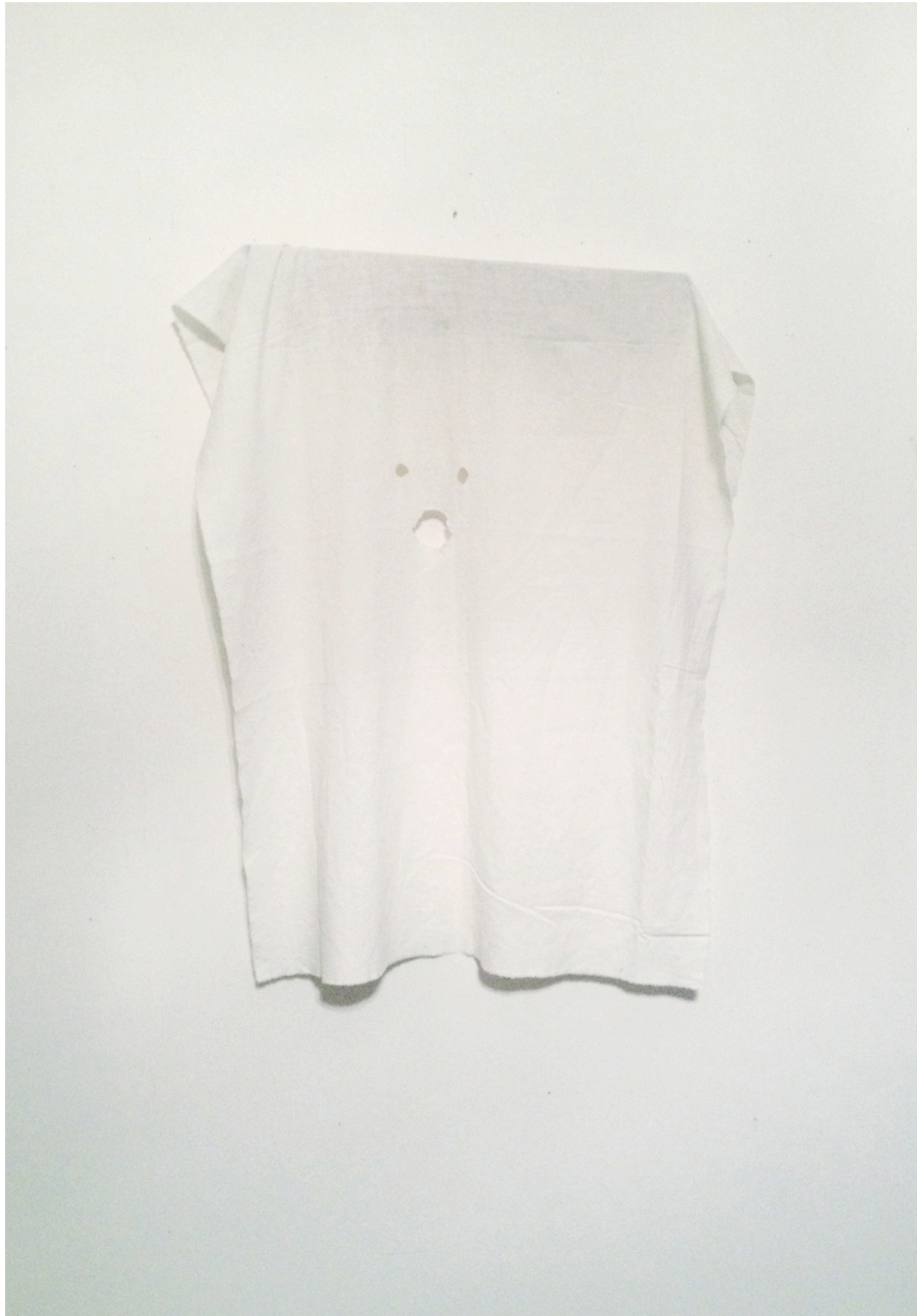
Rada Boukova Ghost , 2017 used fabric, wood, 90 x 50 cm