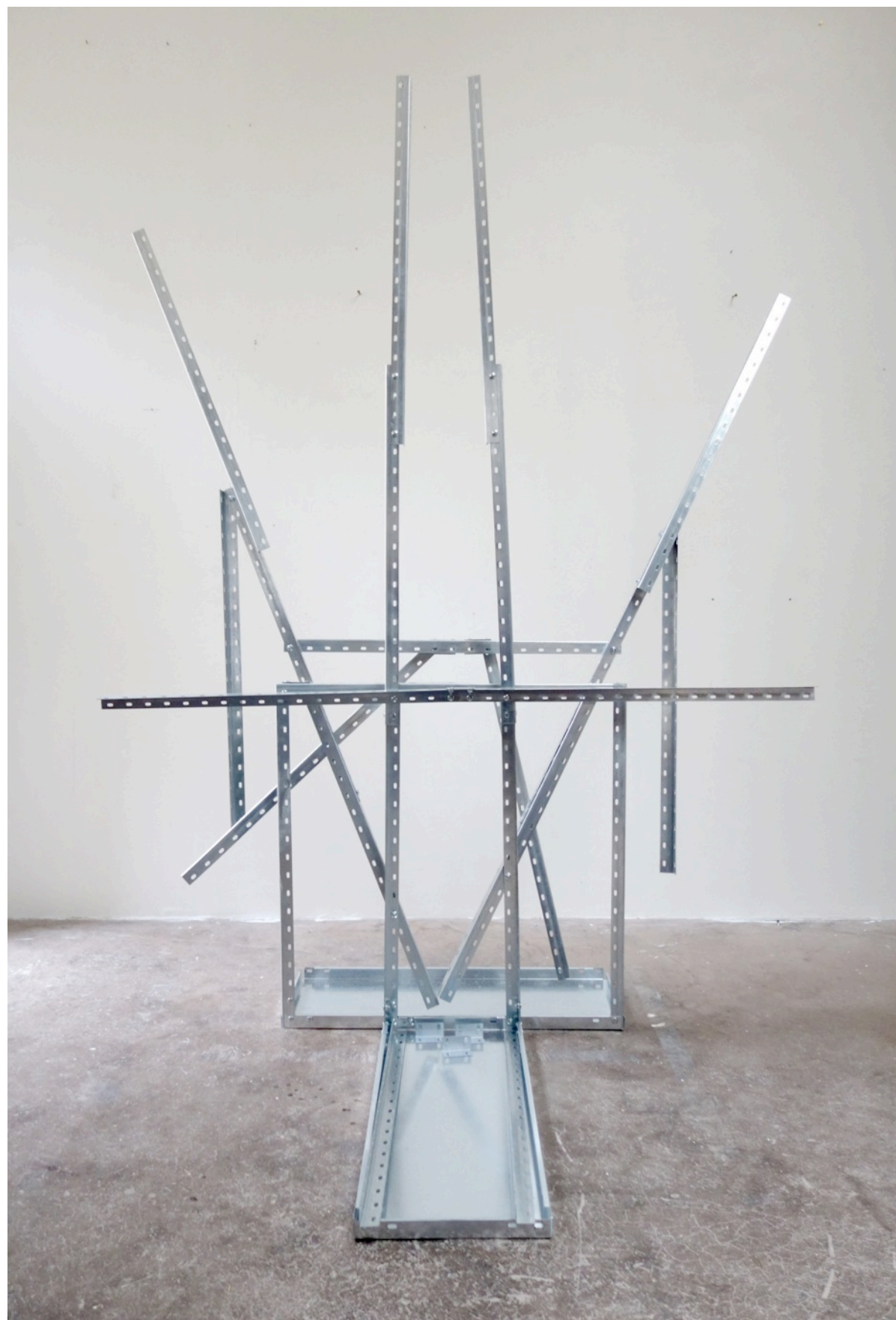
Rada Boukova T , 2017 galvanized steel 204 x 152 x 110 cm