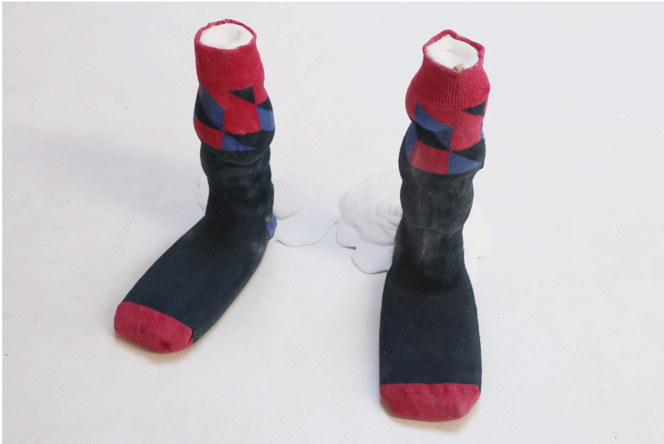
Rada Boukova Standing Up , 2016 socks, plaster 25 x 40 x 35 cm