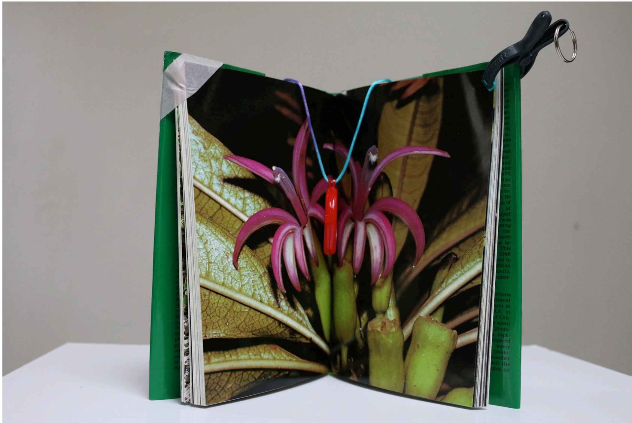
Rada Boukova Hawaii Girl , 2016 book, scotch, locket, clamp 25 x 25 x 20 cm