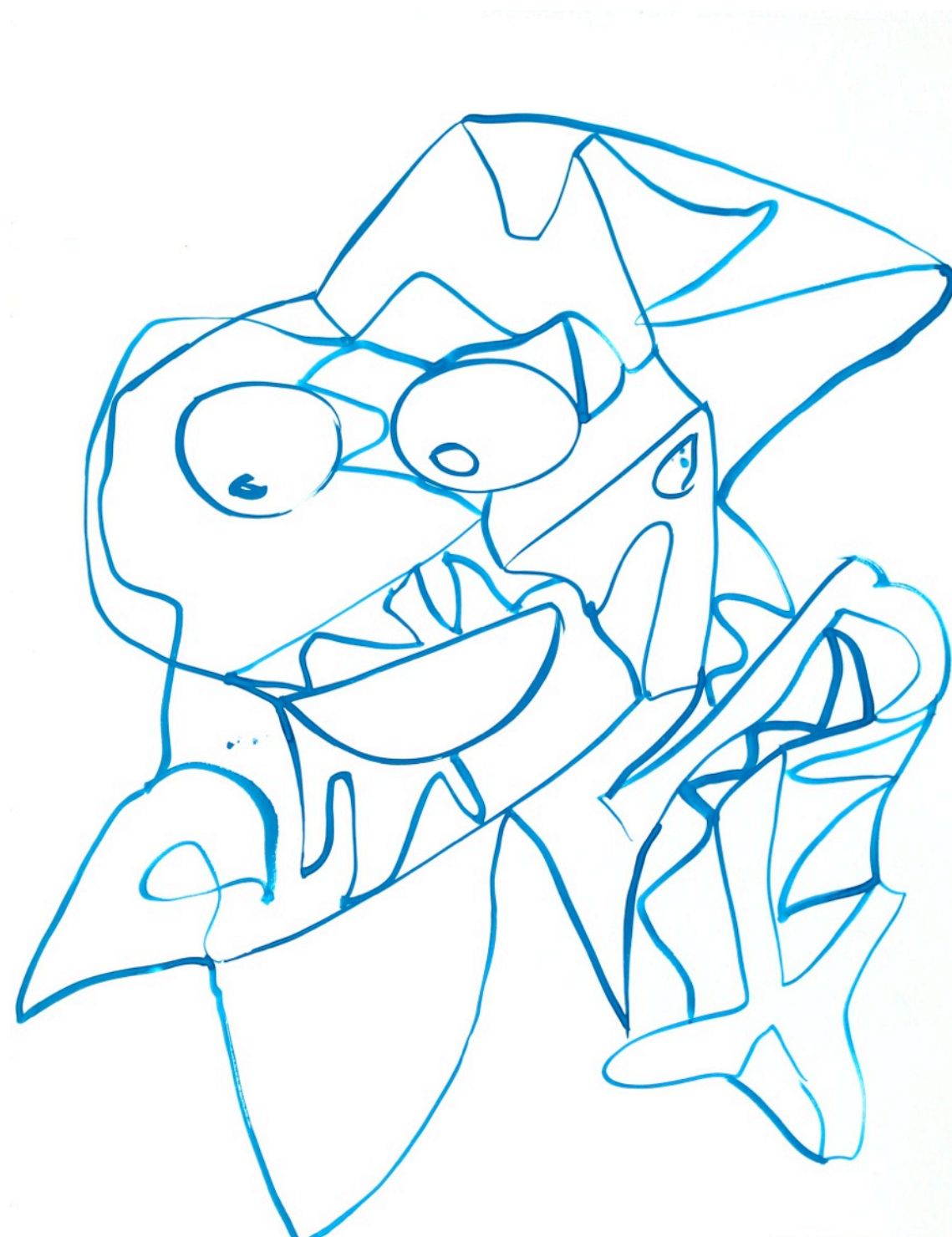
Rada Boukova Marx , 2016 gouache on paper 65 x 50 cm