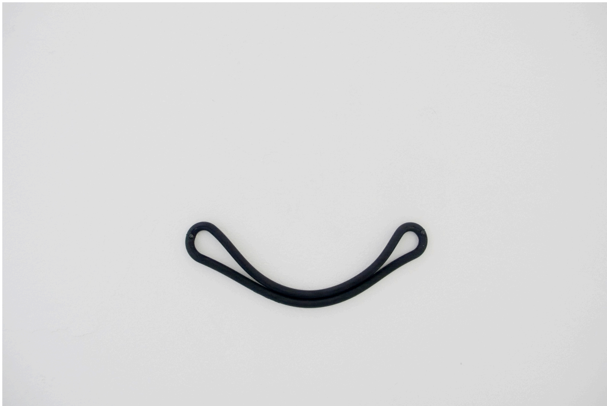
Rada Boukova Sunshine , 2016 rubber, screws 12 x 25 cm