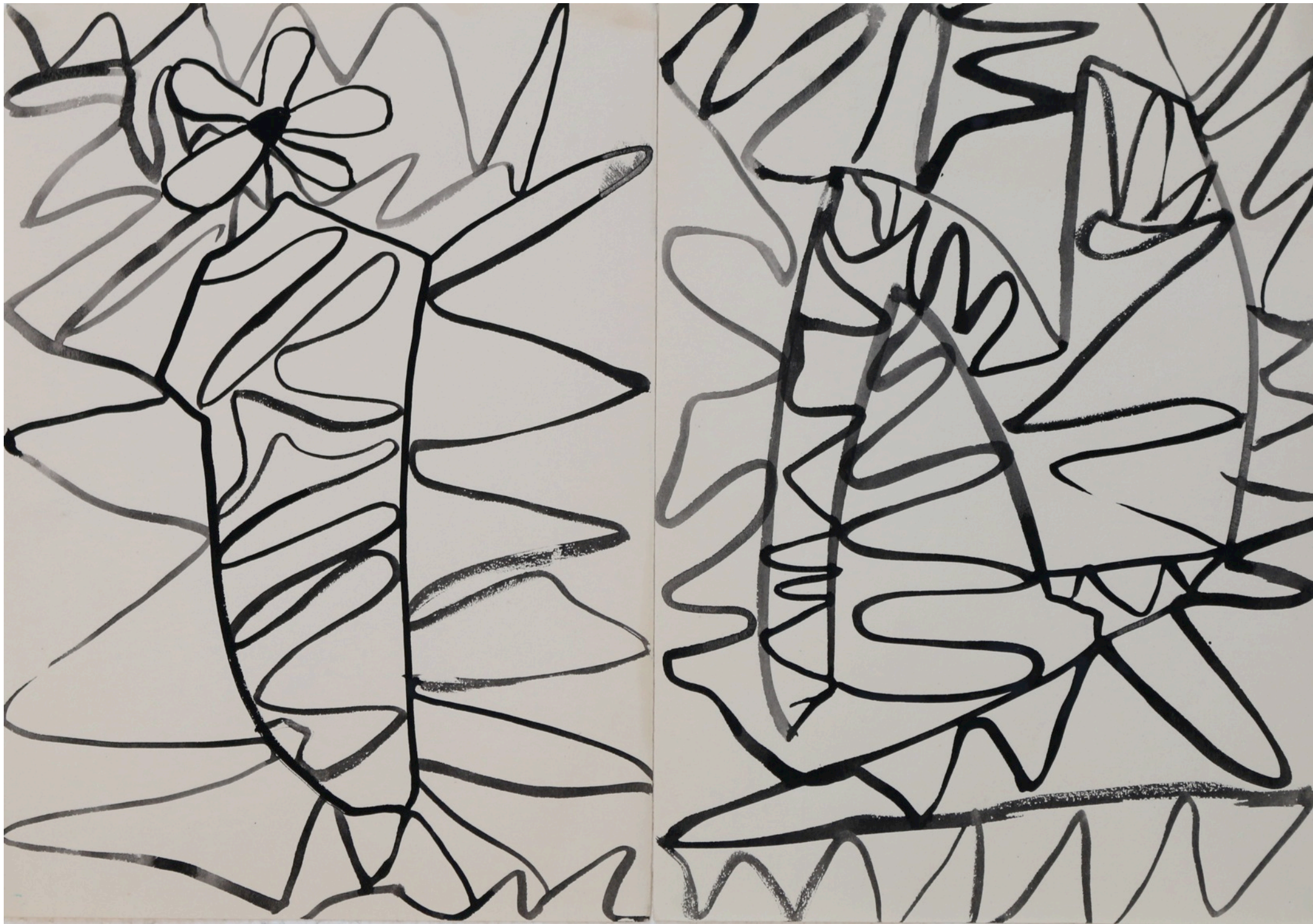
Rada Boukova In , 2015 gouache on paper 30 x 43 cm