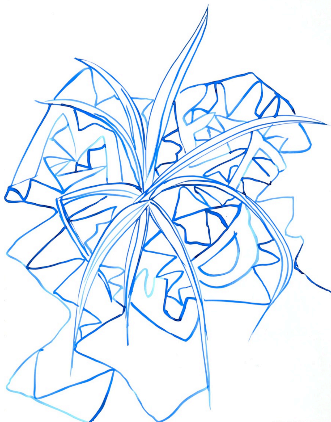
Rada Boukova Merde , 2016 gouache on paper 65 x 50 cm