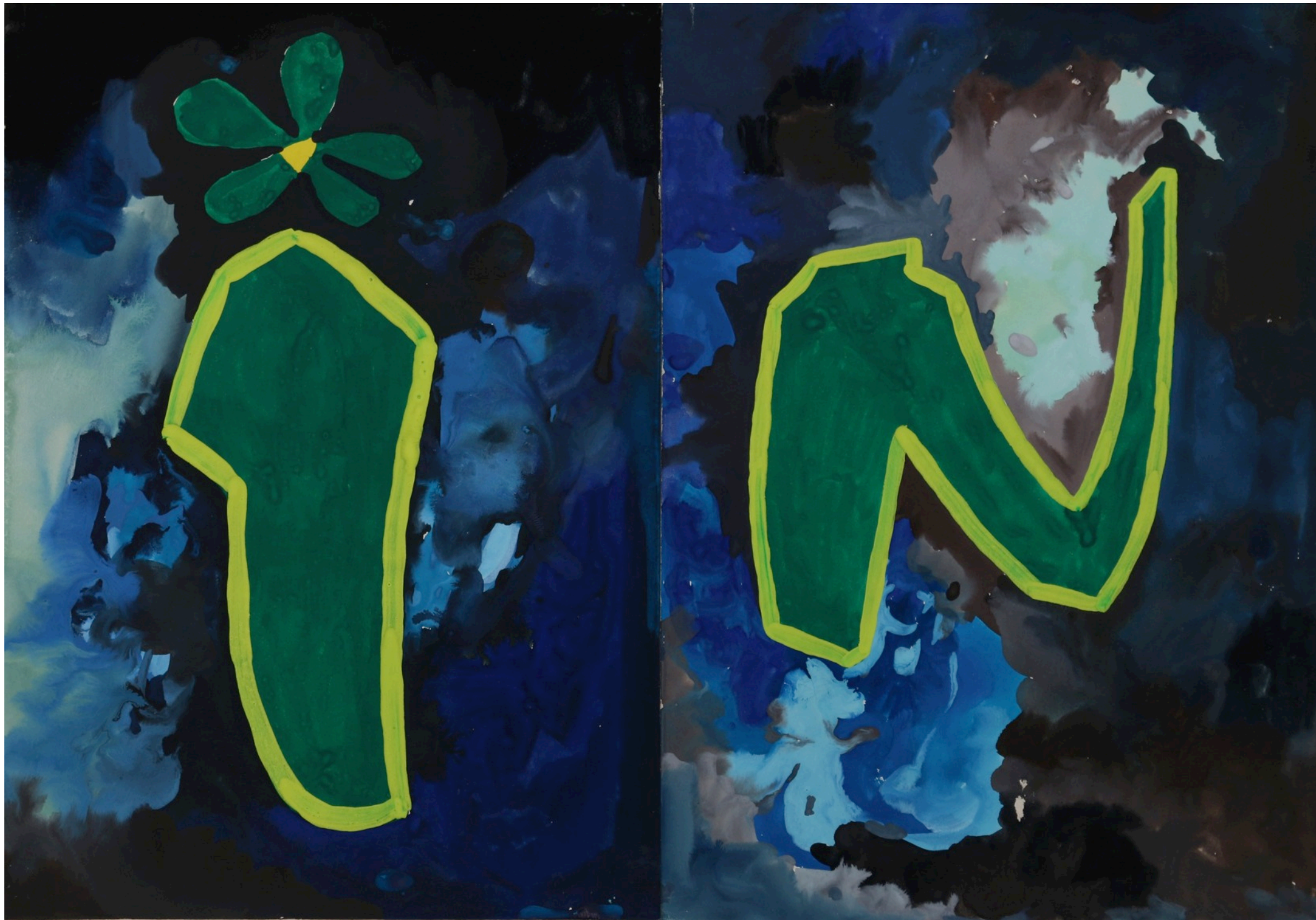
Rada Boukova In , 2015 gouache on paper 30 x 43 cm